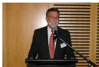
Rod King - President of AREMA